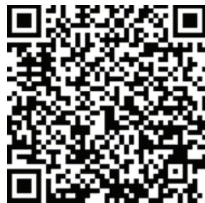
Permit to transport devices and equipment