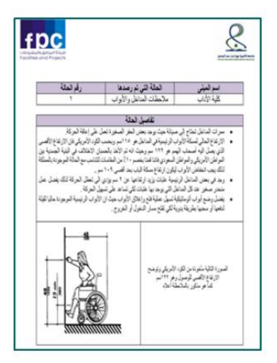
Facilities and projects