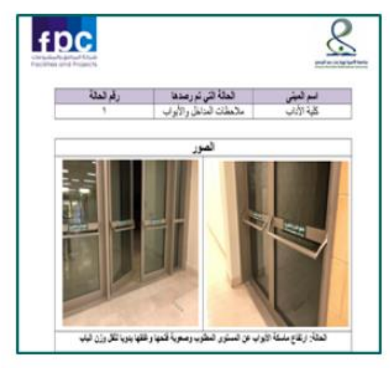
Facilities and projects