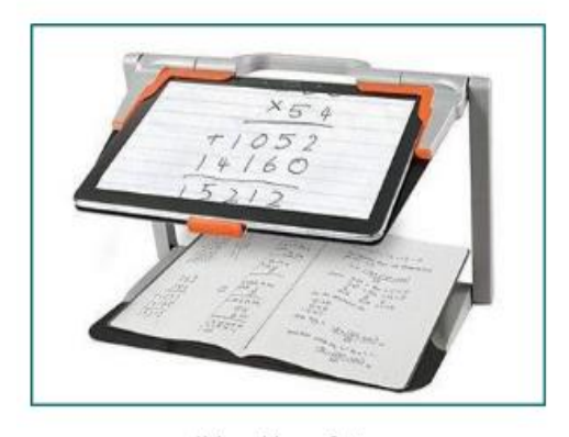
Universal Access Center

Princess Norah University has different teams to adapt to the special needs of its students