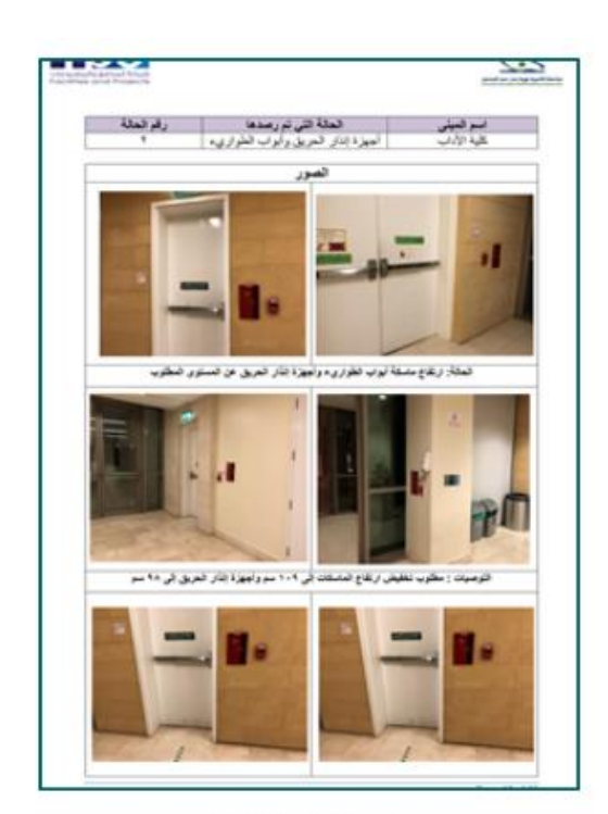
Facilities and projects