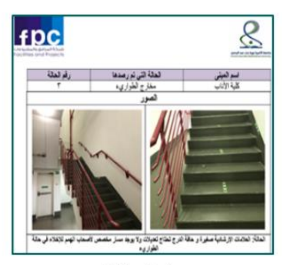
Facilities and projects