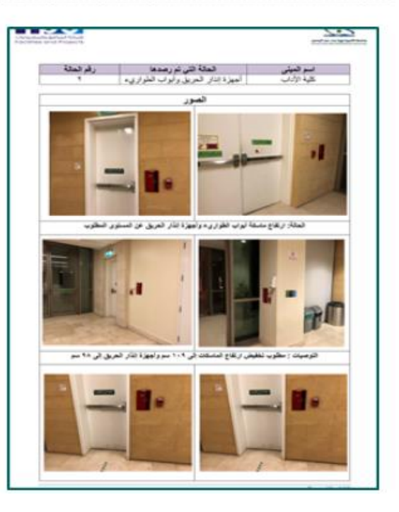
Facilities and projects