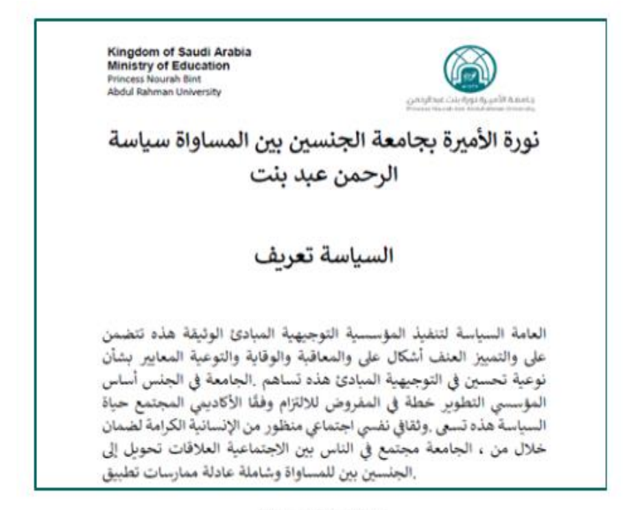
PNU Acceptance Guide

PNU, being a public university, welcomes and complies all government policies of Saudi Arabia, therefore it is consistent with the policies and guidelines established by the Ministry of Education, which have mission is "Make education available to all and raise the quality of its processes and outputs. Develop an educational environment that stimulates creativity to meet the requirements of development. In addition to