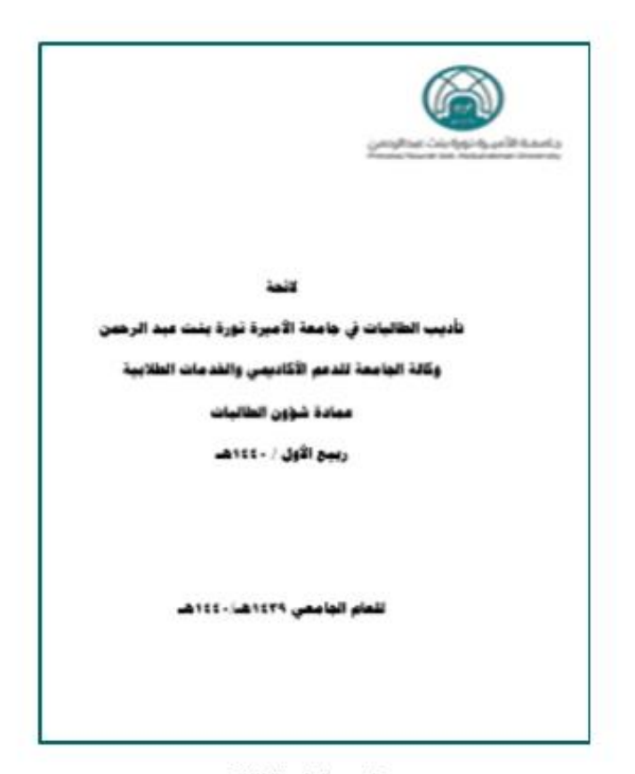
PNU disciplinary list

The next figure is the disciplinary list of Princess Nourah bint Abdul Rahman University