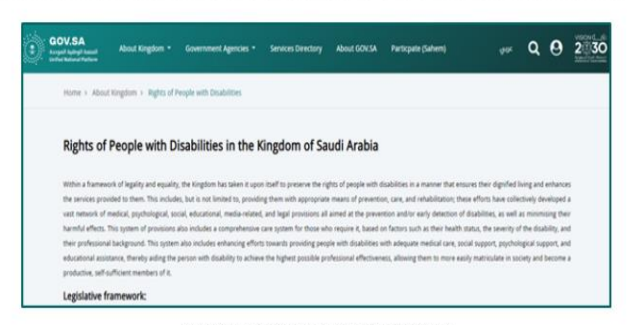
Rights of People with Disabilities in the Kingdom of Saudi Arabia

The most prominent laws, regulations, and decisions that directly protect human rights, and which represent the legal framework for human rights: