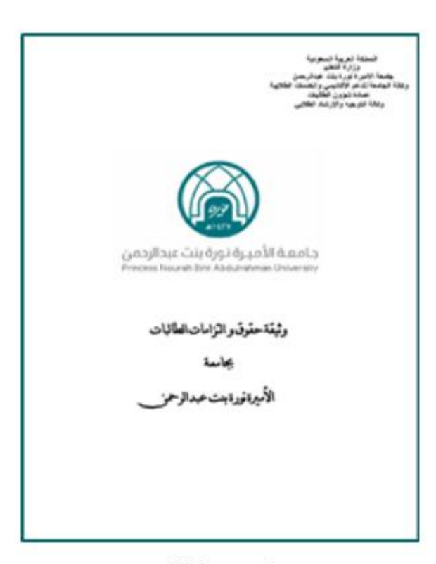
PNU documents 2