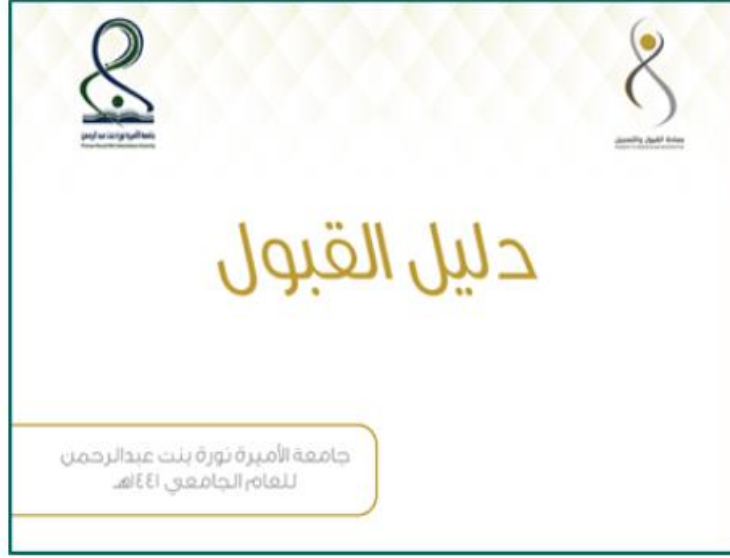
PNU Acceptance Guide

PNU's admission policy supports non-discrimination and equal opportunity. The university does not discriminate on the basis of race, color, national origin, religion, marital status, age, or disability. The university provides an equal learning experience to all its student body.