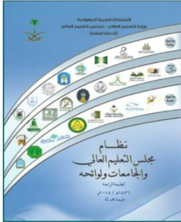
Higher Education Council and universities and its regulations