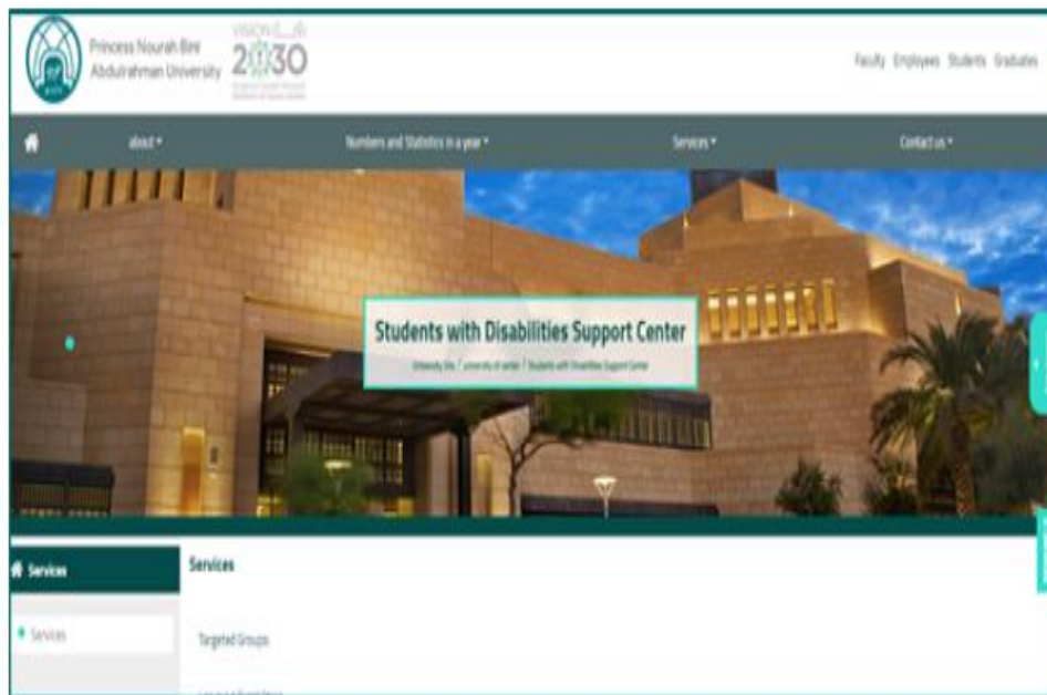
Students with Disabilities Support Center

PNU has a Universal Access Center that guarantees all students with different disabilities the proper development of their activities in the development of academic programs.