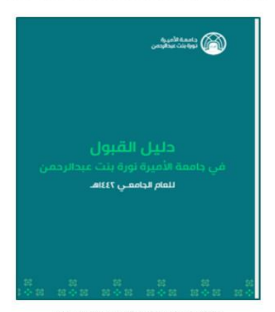
Admission and Registration Guide