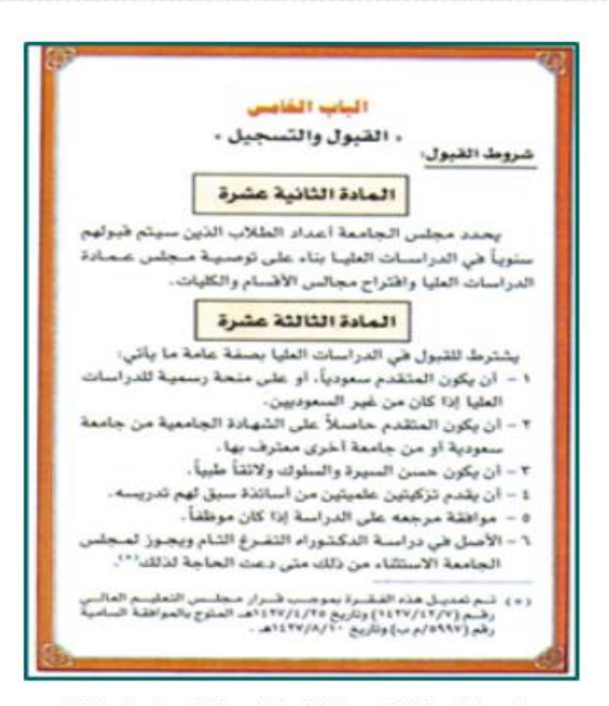
Admission Regulations of the Ministry of Higher Education

The university also allocates committees that study academic cases for female students, as all advanced cases are studied, and recommendations are submitted to the higher authorities to take appropriate action.