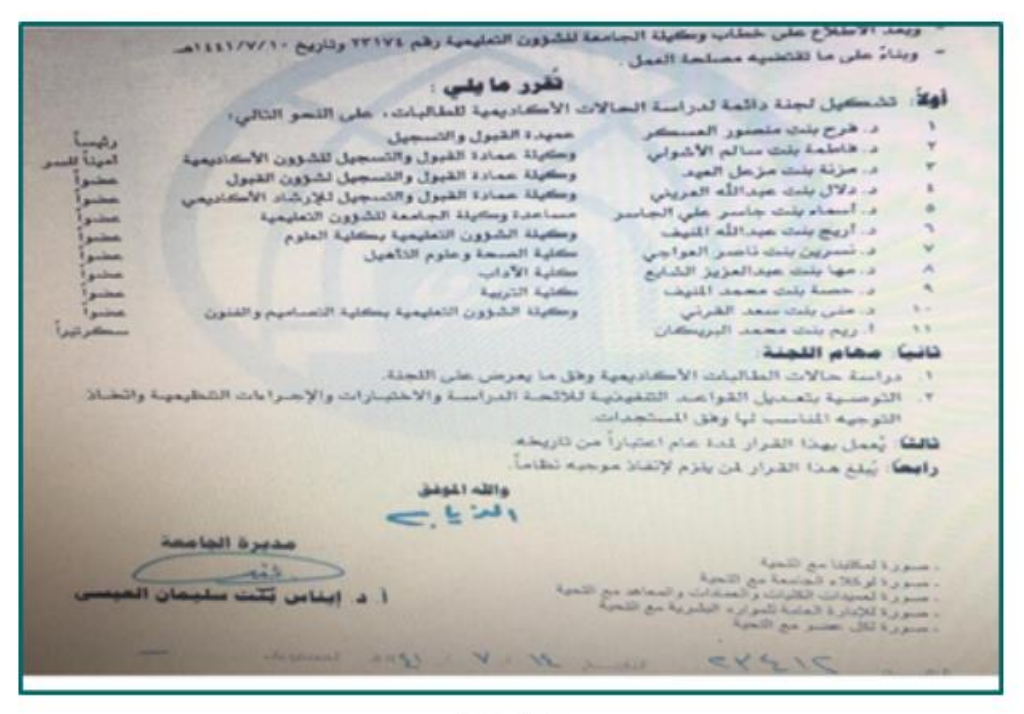
Click to edit text

The next figure is a copy of the permanent committee for studying academic cases of female students.