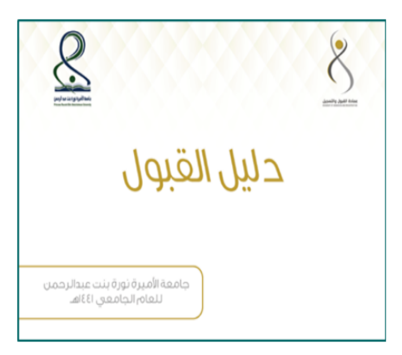
PNU Acceptance Guide

PNU offers diplomas, bachelor's, and postgraduate degrees. It has over 60,000 students in 34 colleges in the city of Riyadh and in the neighboring cities, a preparatory year program for all first-year undergraduate students, an Arabic Language Institute (for non-speakers of Arabic), a Deanship of Community Service and Continuous Education, and a Community College. It has more than 5,000 academic and administrative staff. The next figure shows the policy implemented by the university against discrimination that allows access to any member of society.