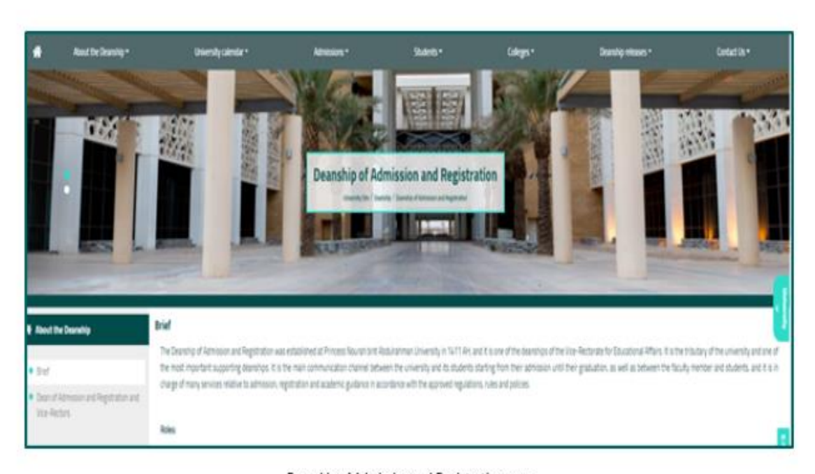
Deanship of Admission and Registration page

The next figure shows of the definition of the Deanship of Admission and Registration page