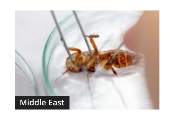
Antibiotics from Cockroaches May Save lives, Finds Joint Study Led by AUS