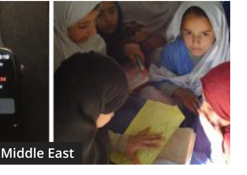
AUS Researchers' New Smartwatch Technology to Play Role of Classroom Observer