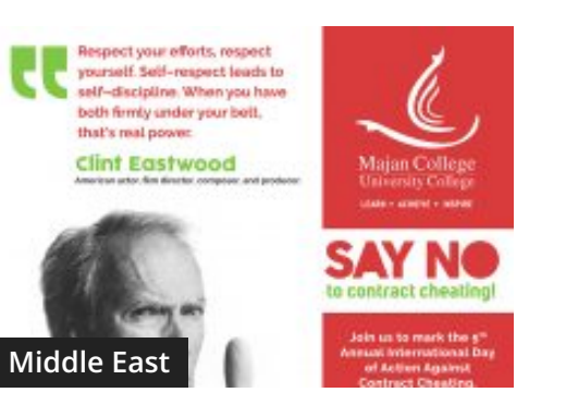
Majan University College Celebrates Academic Integrity Day 2020