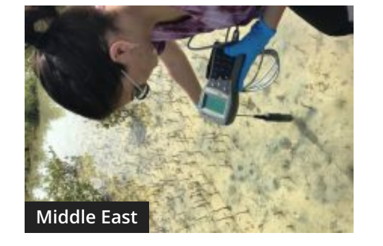
AUS Carries Out First-of-its-Kind Study on One of the UAE's Largest, Oldest and Most Diverse Ecosystems

Former New Zealand Education Minister Participates at Saudi International Conference on Education and Training