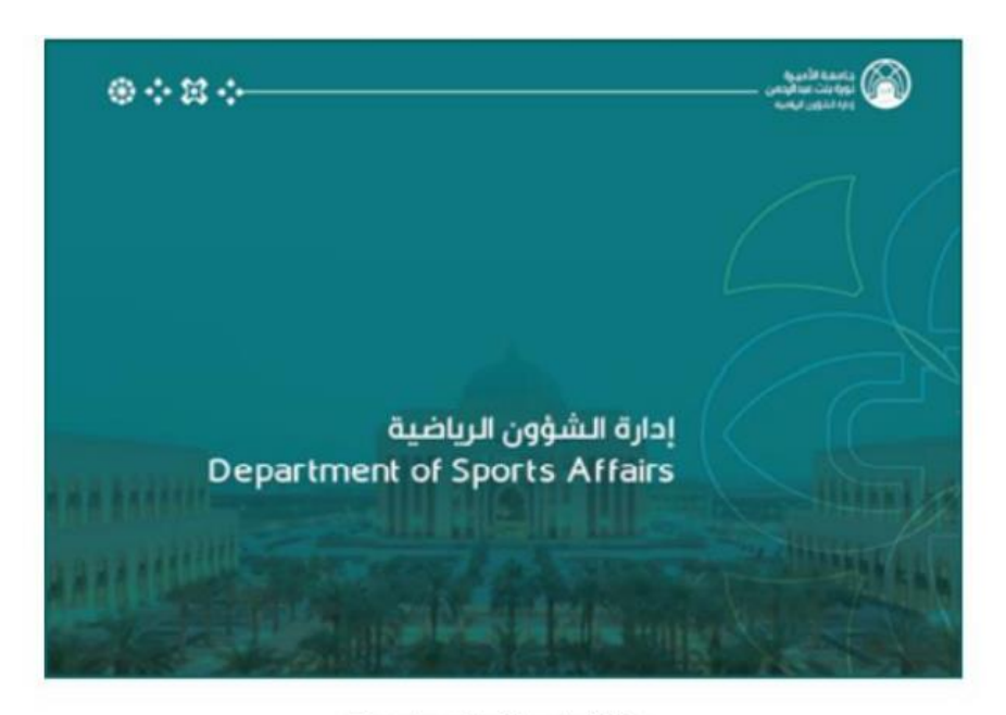
Department of Sports Affairs

PNU has launched a Higher Diploma program in Physical Education for Girls with the aim to prepare qualified cadres to find new job opportunities in the field of sports. It also established a new department, the Department of Sports Affairs, in order to utilized its sports facilities and create a sporting environment where female students are provided with the necessary knowledge and training in various sports disciplines and be able to participate in regional and international sporting events. It also aims at raising the level of community awareness about the importance of Saudi women's practice of sports and adopting a healthy lifestyle. Attached is the Department of sports Affairs report which demonstrates the number of students who participated in different sporting competitions and community sporting events.