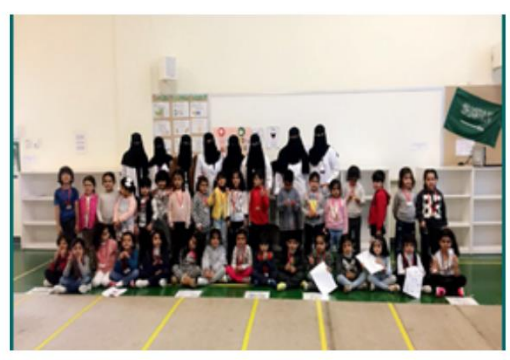
My Little House Nursey