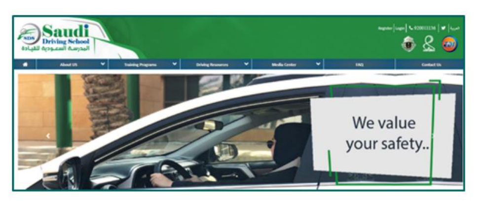
Saudi Driving School

established in partnership with the Emirates Driving Institute in Dubai, which has been in the business of professional driver training in the region since 1991. The Saudi Driving School is also one of the biggest institutes in Saudi Arabia to train driving instructors. Our mission is to provide our trainees with the guidance to become skilled drivers. We also aim to spread a culture of safety in our community, because your safety comes first!