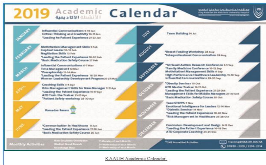
KAUH Academic Calendar

One of the pillars of the hospital is to train the students of Princess Nourah bint Abdulrahman University and provide all the possibilities to create a distinct learning environment for them during their academic studies. The office is concerned with coordinating the training of students from the educational bodies in the hospital according to their needs and the hospital's absorptive capacity for training.