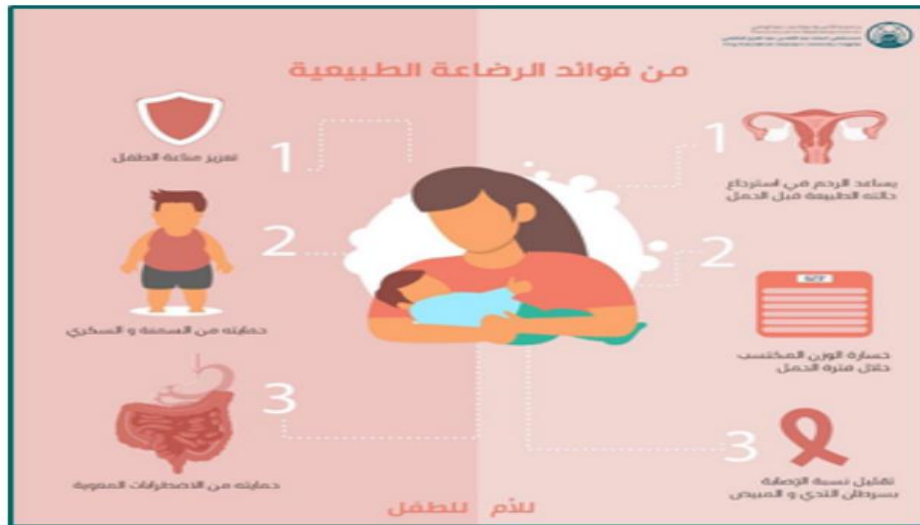
KAAUH Academic Calendar

One Example of the educational awareness courses given in this field in collaboration with King Abdullah bin Abdulaziz University Hospital is the awareness of the benefits of natural breastfeeding.