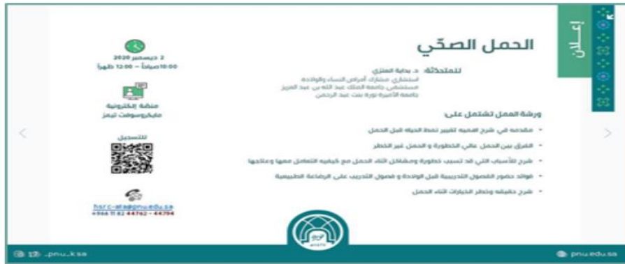
Women's Health Program