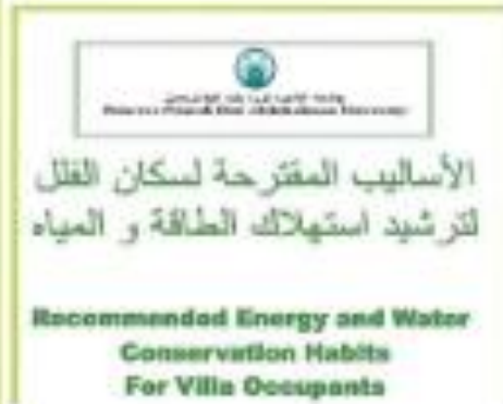
Brochures posted as an energy conservation program which support the water conservation program