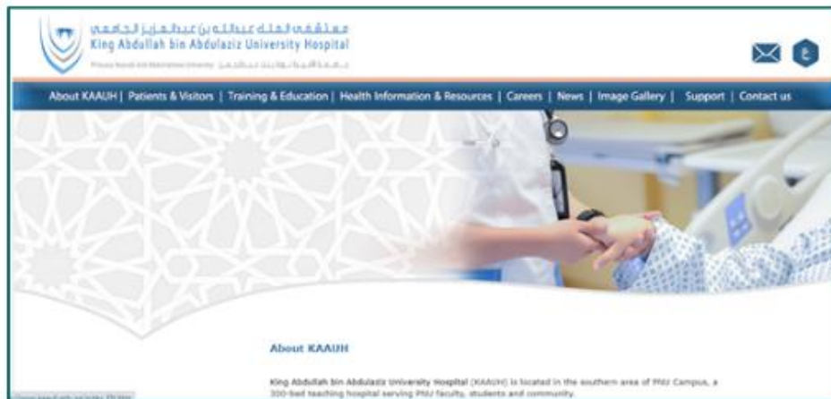
Figure 1. Source [1]

Princess Nourah bint Abdul Rahman University (PNU) has the King Abdullah bin Abdulaziz University Hospital (KAAUH) [1]. As part of the mission of the hospital, it is based on the integration of services provided with education and research that will bring the best knowledge and care to patients and students using the latest technology.