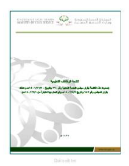
The system of the Higher Education Council and universities and its regulations